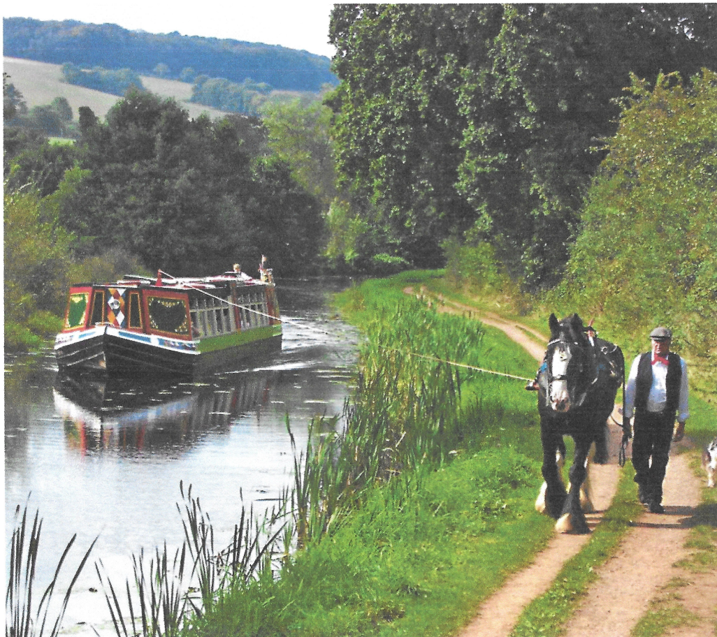
Tiverton Canal

In the heart of Devon lies in the charming town of Tiverton, which is ideally situated for exploring the Devon countryside of traditional thatched cottages, rural villages and stunning coastline. Tiverton has a rich history; it was a centre of the wool trade and lace production and lies on the Great Western Canal, which was originally built to transport lime. Our tour includes a relaxing cruise along the Great Western Canal by horse drawn barge, visits to the beautiful Jurassic coastal towns of Sidmouth and Seaton, historic country houses and gardens and the Cathedral City of Wells.